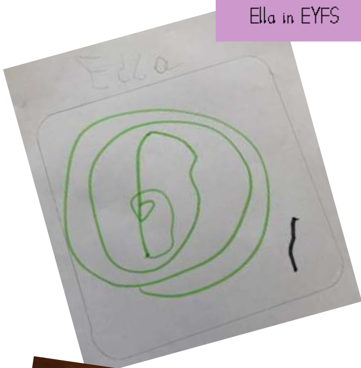
Ella in EYFS

Your children have made us incredibly proud with their engagement with their home learning. Here is a snapshot of some we have seen over recent weeks. All of these are our Stars of the Week. Well done!!