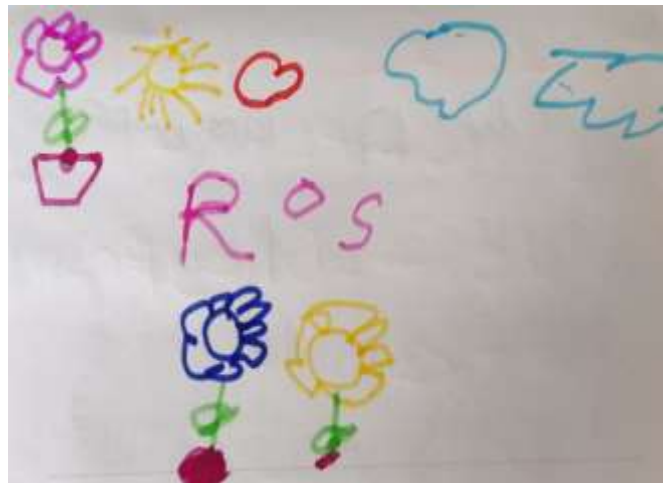
Angeline Tess in Rec